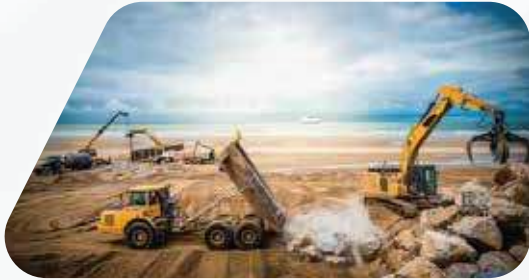
Heavy Equipment Rental