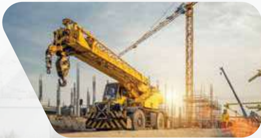
Civil Equipment Rental